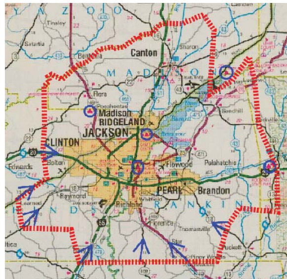
Figure 2: Map of Evacuation Scenario

Their duration times were 80, 25, 25, 10, and 15 minutes, respectively. The simulation results also showed the effectiveness of traffic control and ITS deployment. 🌀